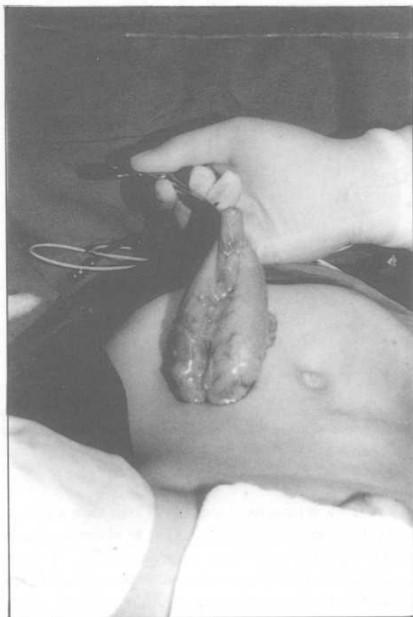
FIG. 3 Withdrawal of the transverse colon to identify the degree of redundancy of the transverse colon.