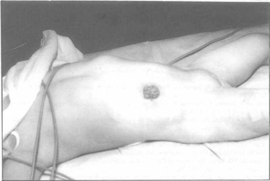
FIG. 4 At the time of closure of the umbilical level transverse colostomy after 11 months of having the stoma (good site for the application of the colostomy bag).

verse colostomy in the right iliac fossa; they indicated that it is not mandatory to construct the transverse colostomy at the right upper quadrant but to choose the optimum site for each patient [33] .